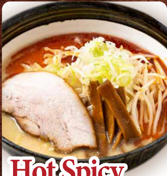
Hot Spicy Miso Noodle