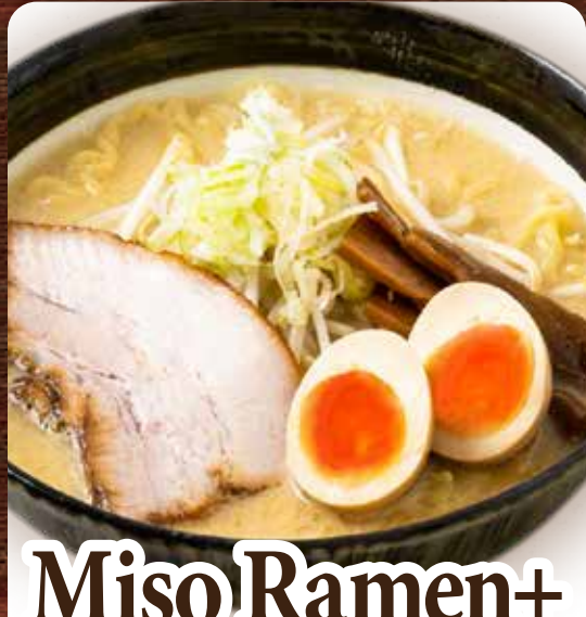
Miso Ramen+ Seasoned Egg