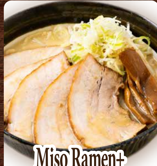
Miso Ramen+ 4 Slices of Pork Chashu