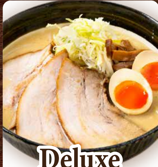
Deluxe Miso Ramen