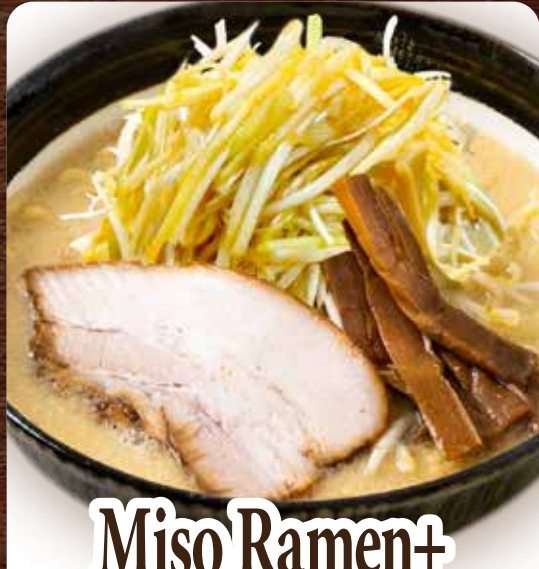
Miso Ramen+ Sliced Japanese Leek