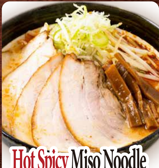
Hot Spicy Miso Noodle +4 Slices of Pork Chashu