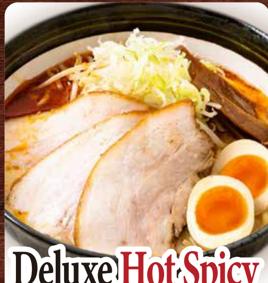
Deluxe Hot Spicy Miso Noodle