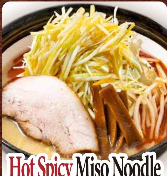
Hot Spicy Miso Noodle +Sliced Japanese Leek